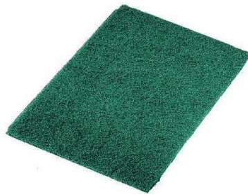
Figure 1: Cleaning Pad

5.0 DEFINITIONS: Feet Cleaning Pad remove debris and impurities from the bottom of shoes as personnel enter a clean room. While Sticky mat are made of polyethylene coated with adhesive contains the adhesive material with which all dirt, dust, lint, and other contaminants got stick and avoid from entering the stringent controlled environments.