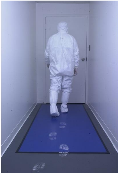
Figure 2: Sticky Mat