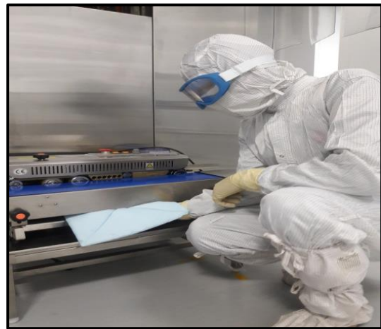
2. Lower side cleaning of Conveyor