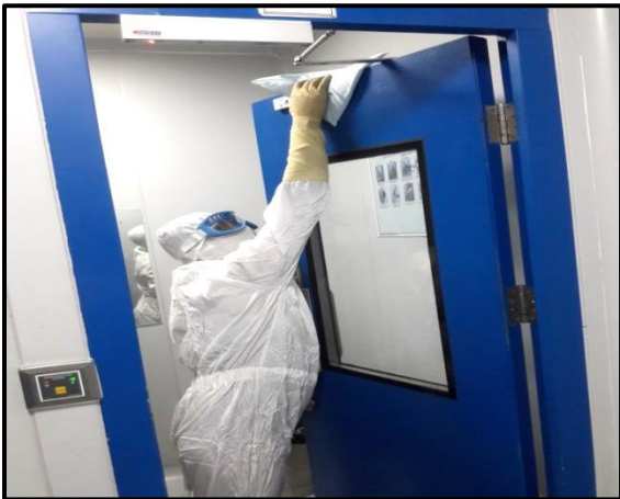
3. Inner Surface of Door Cleaning