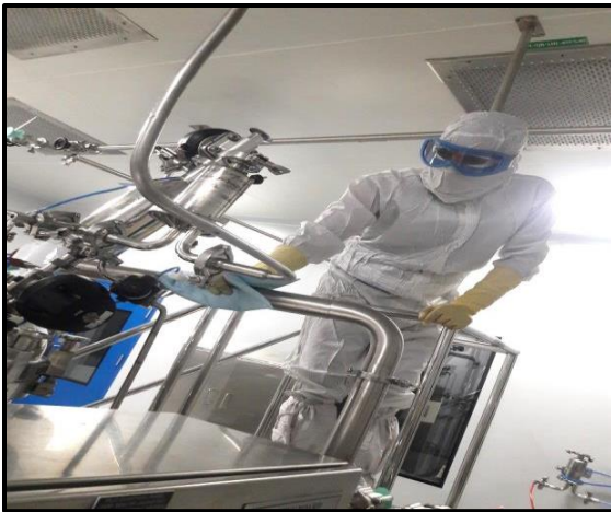
1. Outer surface of pipe Line