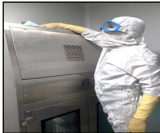
4. Upper Surface of DGSC Cleaning