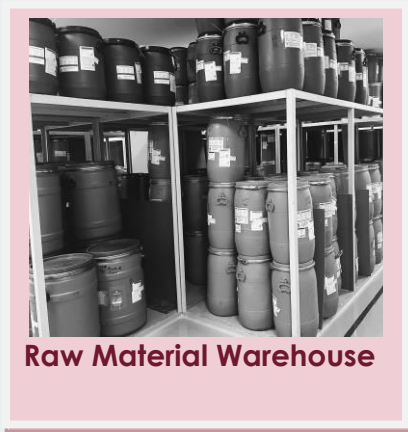
Raw Material Warehouse