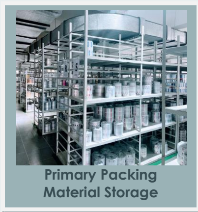
Primary Packing Material Storage